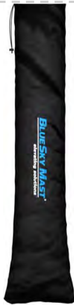
Bag - Pole - Black P/N: BSM2-B-P400-BAG-BLK 1.1 lbs / .5 kg