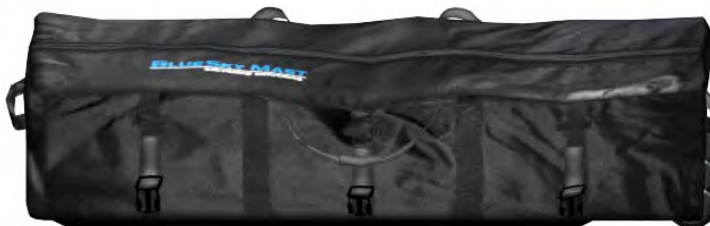
Wheeling Carry Bag P/N: BSM2-B-P305-BAG-3WH 23.7 lbs / 10.8 kg