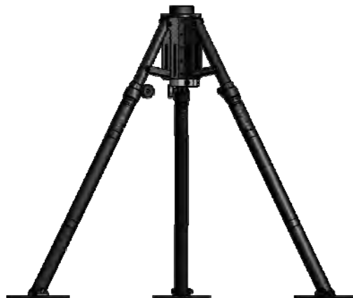
Tripod with Base Plates P/N: BSM2-P-T200-POD-000 16.7 lbs / 7.6 kg