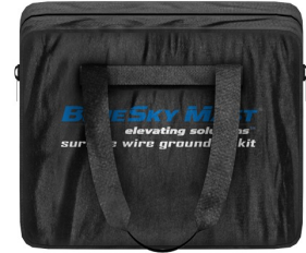
Grounding Bag BST2-B-P300-BAG-GND