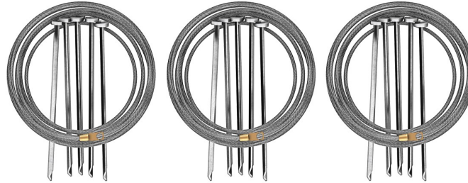
Stainless Steel Cable w/Stakes BST2-P-C225-GND-000