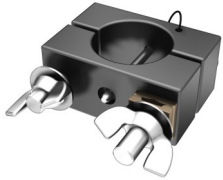
Grounding Bracket BST2-P-B205-GND-000